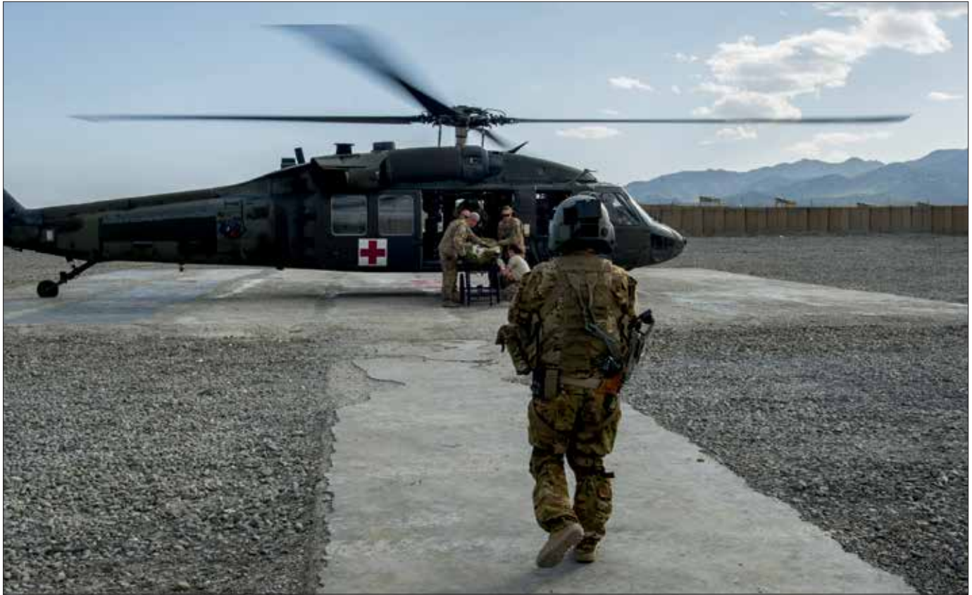
Tactical critical care evacuation team nurse (forefront) assigned to Army's 3 rd Platoon, C Company, 2-149 General Support Aviation Battalion Medical Evacuation, prepares for patient transfer mission, May 13, 2013, at Forward Operating Base Orgun East, Afghanistan

techniques, and procedures (TTP). In this case, there were distinct differences in medical TTPs within the hospital command and control procedures and in the practice of trauma care between the United States and UK. In the vast majority of cases, these differences were not better or worse—just different. These differences in roles and responsibilities and in clinical medical practice were clarified in advance of deployment to ensure trust, cooperation, and smooth interoperability among international colleagues.